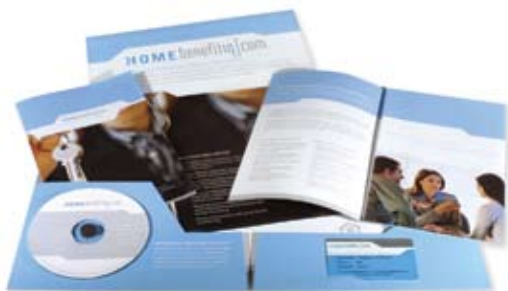
Improve your effectiveness with HomeBenefitIQ professional, personalized sales support collateral.

Increase business and drive up revenue by becoming a HomeBenefitIQ member.